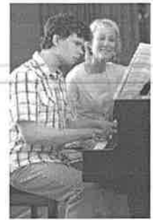
Ms. Reyes is not playing the piano.

Ms. Reyes is teaching Dan. She is not singing with him. They are playing music. They are not playing basketball.