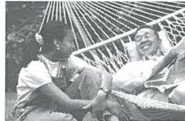
I am visiting Grandpa.